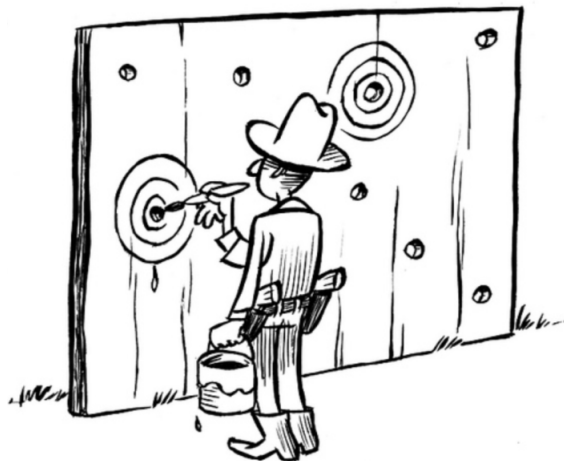
Figure 2. HARKing (Hypothesising After the Results are Known) is an instance of the Texas sharpshooter fallacy. Illustration by Dirk-Jan Hoek, CC-BY.

Publication bias encourages researchers to explore hypotheses that are different to those that they originally set out to test (Figure 1c and f). This practice is called ‘HARKing’ [23], which stands for Hypothesising After the Results are Known, also known as ‘outcome switching’.