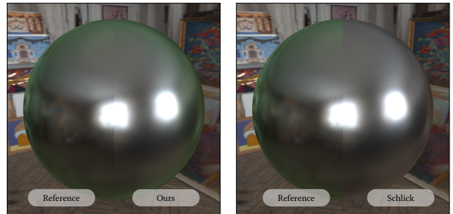
Figure 2: Our method reproduces better the edgetint than Schlick's decomposition compared to a Monte-Carlo reference. We used r = [0.44, 0.44, 0.44] , g = [0, 1, 0] and \alpha = 0.08 .

Figure 1 (b), show the integration of our decomposition for a Beryllium conductor in Unity. In Figure 2, we show in our OpenGL prototype that our method correctly reproduces the edgetint of Gulbrandsen. There, we measured that our method was at most 0.05 ms slower than Schlick's decomposition in full screen at 720p on an Nvidia RTX 2070.