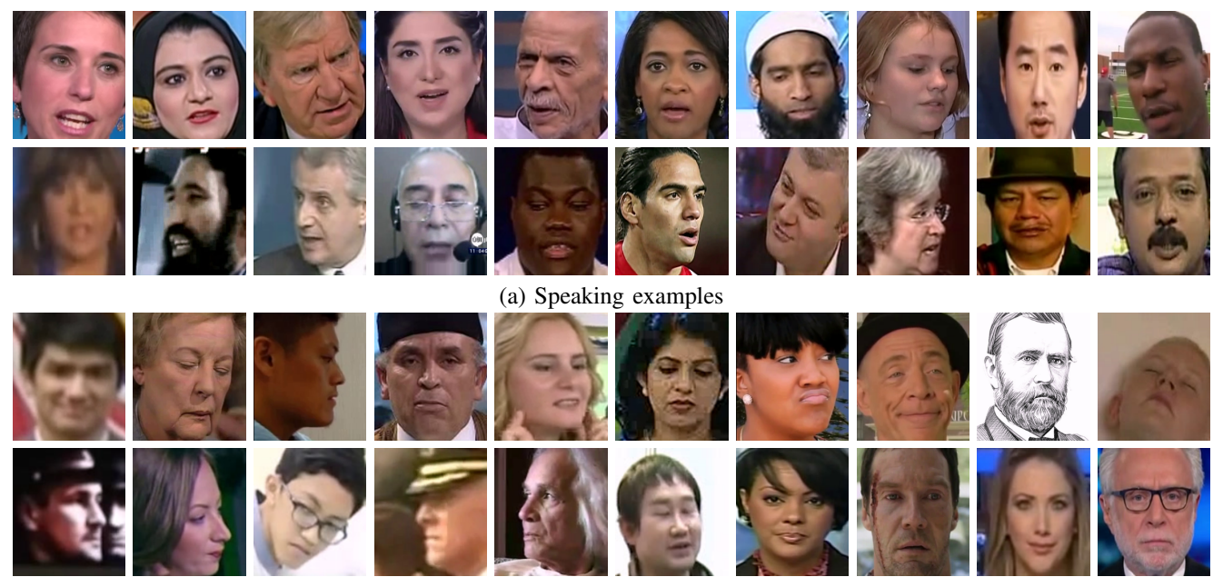
(b) Silent examples