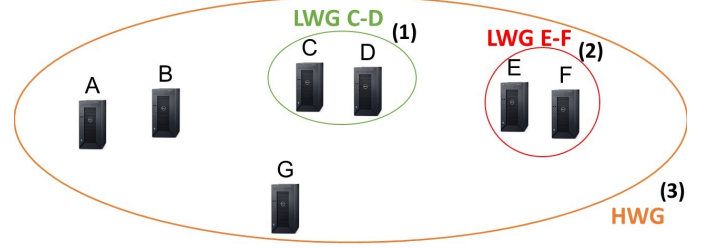
Figure 2. A LWG-based system to support distributed applications in Fog Computing.

Moreover, in order to cope with scalability and the fact that maintaining these various LWGs bring a non negligible cost to the system, we intend to create LWGs considering two aspects. Firstly, in terms of group granularity, LWGs must be created between pairs of surrogates. This represents the smallest member affiliation set possible for each LWG, guaranteeing that the cost of group membership information is the lowest possible and thus scalable. On the other hand, not all possible combinations of surrogates pairs will result in the creation of a LWG. Instead of having N^2 LWGs, where N is the number of surrogates present in the system, LWGs will only be created if considered relevant to the system. I.e. when the analysis of the application state usage identifies that recurrent regional transactions are being requested between a pair of surrogates that justify the creation of a LWG to forward and validate such transactions. Figure 2 graphically depicts our system model based on this LWG abstraction. LWGs (1)-(2) are created between surrogates that recurrently share application state in regional transactions. In this example of a system composed with 7 surrogates, only two LWGs exist: one between surrogates C and D, as well as one between