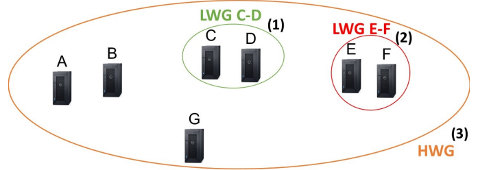
Figure 2. A LWG-based system to support distributed applications in Fog Computing.

Moreover, in order to cope with scalability and the fact that maintaining these various LWGs bring a non negligible cost to the system, we intend to create LWGs considering two aspects. Firstly, in terms of group granularity, LWGs must be created between pairs of surrogates. This represents the smallest member affiliation set possible for each LWG, guaranteeing that the cost of group membership information is the lowest possible and thus scalable. On the other hand, not all possible combinations of surrogates pairs will result in the a creation a LWG. Instead of having N^2 LWGs, where N is the number of surrogates present in the system, LWGs will only be created if considered relevant to the system. I.e. when the analysis of the application state usage identifies that recurrent regional transactions are being requested between a pair of surrogates that justify the creation o LWG to forward and validate such transactions. Figure 2 graphically depicts our system model based on this LWG abstraction. LWGs (1)-(2) are created between surrogates that recurrently share application state in regional transactions. In this example of a system composed with 7 surrogates, only two LWGs exist: one between surrogates C and D, as well as one between