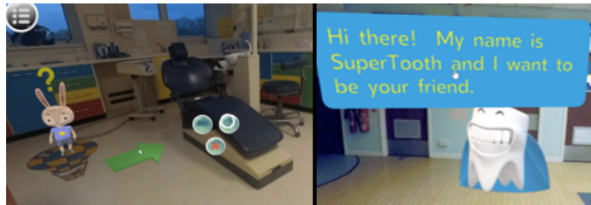
Fig. 1. The Virtual Reality Environment - exact replica of the dental clinic - with interactive characters to guide children.