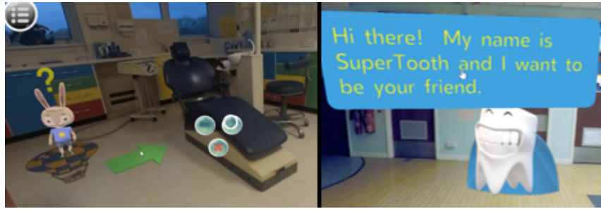
Fig. 1. The Virtual Reality Environment - exact replica of the dental clinic - with interactive characters to guide children.