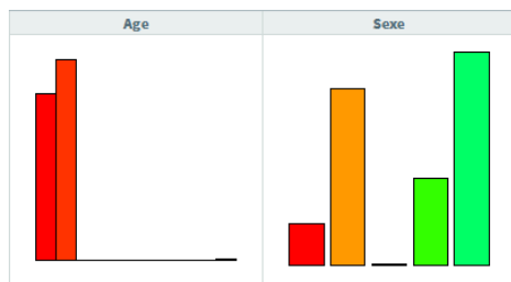
Fig. 2. Detection of problematic variables at a glance. There is an outlier in Age and Sex is incorrectly coded.