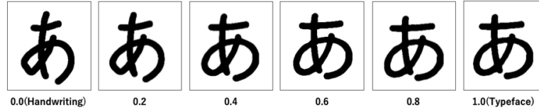
Fig. 1. Japanese character “あ” of the fusion ratio between handwriting and type character at intervals of 0.2 between 0.0 and 1.0.

Also, we set the fusion ratios of the core and the thickness separately this time. Here, the core is a portion of the character's skeleton.