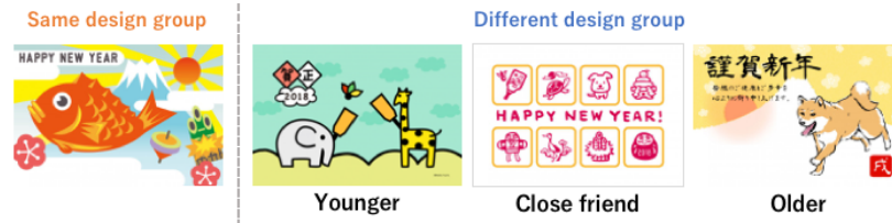
Fig. 4. Templates of the message card that we used in the experiment.

In addition, after each of the message cards was completed, the participants were asked about the message card that they created and the utilization of the system. The participants of the same card design group were ten people (six males, four females), and the participants of the different card design group were ten people (four males, six females).