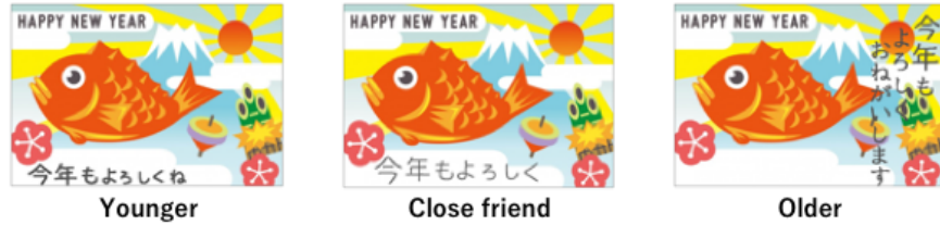
Fig. 7. Example of products with the same design