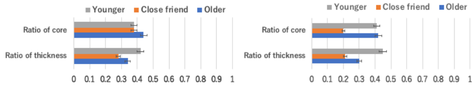
Fig. 5. Mean of the ratio of the core and thickness when the card was completed.

The graphs in Fig. 5 summarized the mean of the ratio of the core wire and the thickness for every three types of relationships.