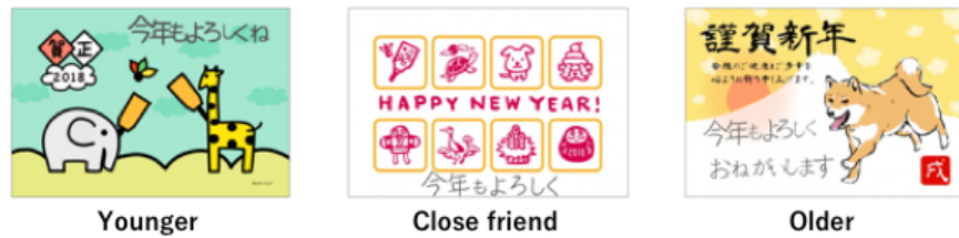
Fig. 8. Example of products with different design