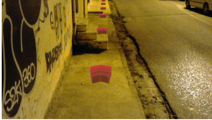
Fig. 1. Virtual arrows augmented the physical space and guided the users to their destination.

Participants We recruited 28 participants (12 females, 16 males) of varying age ( MIN = 19 , MAX = 36 , M = 26 , SD = 5 ). All participants had the same level of experience with navigation tools (they were familiar with geolocation and positioning technologies, such as GPS and Google Maps), HoloLens (none of them had ever used HoloLens or other HMD device), and use of AR systems to navigate (none of them had ever navigated with the assistance of an AR tool). Each participant used only one version of HoloNav , hence, they were allocated in either the W – PSP or the WO – PSP group. The participants of the W – PSP group used the HoloNav version that was built with persistent spatial points (i.e., spatial anchors), while the participants of the WO – PSP group used the HoloNav version that was not based on persistent spatial points. Aiming to create balanced groups (e.g., same size, equal distribution of age and gender), the allocation was based on the participants’ demographic characteristics.