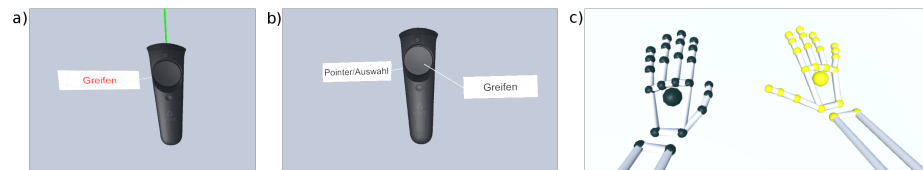
Fig. 1. Screenshots of HTC Vive based example implementations of three of our interaction modes: a) laser mode with controller attached tooltips, b) controller mode with tooltips, c) hand mode.

Further details: The mechanism for object usage can also be used for object grabbing. We implemented this for the purpose of consistency. We implemented a color highlighting if an object is selected using the laser beam as in the laser mode. Also in this mode, tooltips can be used to describe the controller buttons functionality. An example for this implemented with an HTC Vive controller is shown in Figure 1b. As multiple buttons are used in this mode, the tooltips should become partly transparent to indicate which button is pressed. In addition, they should change their caption depending on what can be triggered with the buttons (use or grab) in a certain situation.