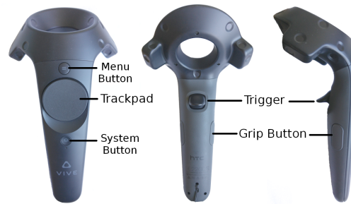
Fig. 3. Different views on an HTC Vive controller with its buttons.

to the Vive, we used a Leap Motion [18]. This device is a small hand tracker. It can be attached to the headset of the Vive so that the tracking of the hands is performed from the head of the user. Both devices allowed us to implement the four categories of VR systems and our interaction modes as follows: