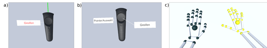
Fig. 1. Screenshots of HTC Vive based example implementations of three of our interaction modes: a) laser mode with controller attached tooltips, b) controller mode with tooltips, c) hand mode.

Further details: The mechanism for object usage can also be used for object grabbing. We implemented this for the purpose of consistency. We implemented a color highlighting if an object is selected using the laser beam as in the laser mode. Also in this mode, tooltips can be used to describe the controller buttons functionality. An example for this implemented with an HTC Vive controller is shown in Figure 1b. As multiple buttons are used in this mode, the tooltips should become partly transparent to indicate which button is pressed. In addition, they should change their caption depending on what can be triggered with the buttons (use or grab) in a certain situation.