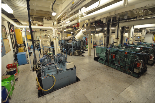
Fig. 1. Engine room of the Red Falcon, Red Funnel fleet

sound, vibration, heat and smell, these are not commonly replicated effectively in simulations [5].