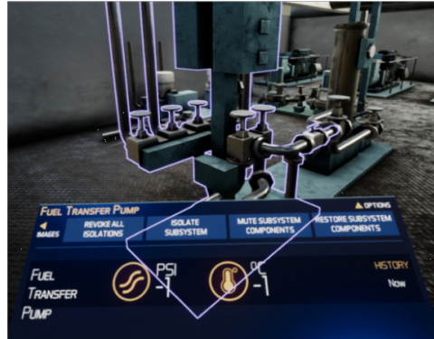
Fig. 2. Selected component outlined, virtual handheld display shown towards the bottom of the figure

and vibration signals are used across several components to represent a particular mechanical failure. As a result, a user can explore and identify virtual failures using familiar techniques as he/she might do normally in-situ. Hand-