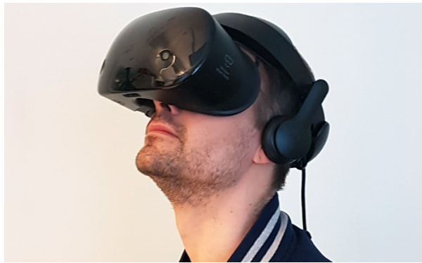
Figure 1. HMD device with an integrated headset.

User Interface and Interaction. In CityCompass VR, the users can freely explore the ODV content by turning their head to the desired direction. The screen is divided into two viewports, thus creating the illusion of a stereoscopy and a sense of depth to the user. Both users have their own HMD (Figure 1) devices and have their own individual views of the application (see Figure 2).