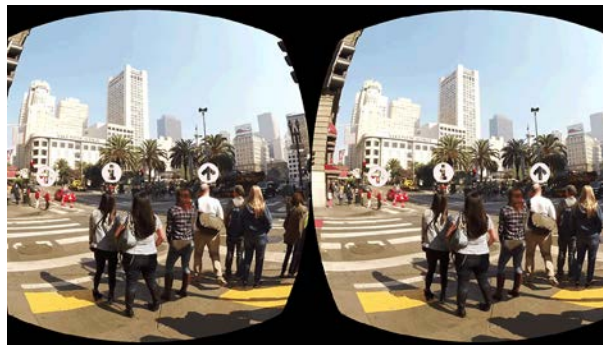
Figure 2. Screenshot from the CityCompass VR application. The application is divided into two viewports.

The application has two types of user interface elements: exits and hotspots . Exits transition both users to the next scene, and hotspots provide contextual information about the environment. These interface elements are activated with a dwell-timer, i.e. the user has to focus on the desired element for pre-defined time in order to activate it.