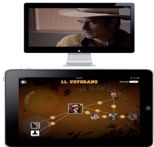
Figure 2. Story-Map's character map with the broadcast programme in the background [11]

Characters who were mentioned but who had yet to appear were greyed. Characters who had appeared but were not currently present were indicated by a reduced size icon. Rather than showing who is literally visible in the frame, the map showed who was present in the semantic dramatic unit. Characters were also grouped according to geographical location and were iconified, providing access to a brief biography which was updated with the narrative. No evaluation trials with Story-Map have been reported.