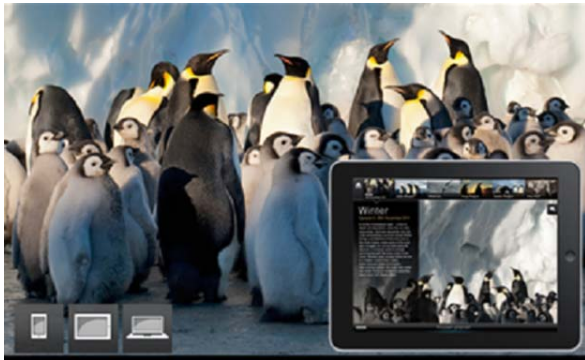
Figure 1. Frozen Planet companion second screen [1].

representational functions required of second screens for science programmes. The first exemplar is the second screen developed for an episode of Frozen Planet [1]. This app pushed content to the viewer in synchrony with the programme; with each animal introduced in the programme, a thumbnail image/ icon appeared in the app, giving access to a summary of facts about the animal which could be bookmarked.