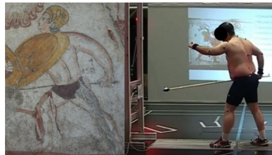
Figure 1 – (left) Sample icon representative of a plausible low posture, low targeted zone and spear attack. (right) Initial posture of one trial, developed from the icon. The subject is hitting a force sensor, and is equipped with motion capture markers.

From the corpus of lucanian frescoes tomb paintings and the knowledge from ancient roman and greeks literatures, corresponding to this period of the antiquity, a subset of initial attack postures supposed to be the most historically and biomechanically plausible was extracted. Postures were extracted with regard to the attack type (high or low posture) and the type of weapon (spear or javelin). The targeted zone (upper or lower body) corresponded to a trunk or leg attack on a fighter of the size of the subject, that are the most represented wounds in the corpus.