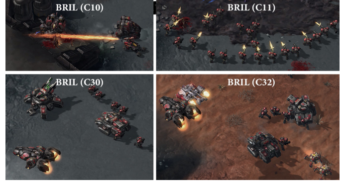
Fig. 3. Typical army compositions produced by our trained BRIL policy with behavioral features corresponding to the centroids of cluster 10, 11, 30 and 32. BRIL (C10) executes early timing pushes with Hellions and Cyclones, BRIL (C11) is aggressive with Marines only, BRIL (C30) creates mixed armies with many Marines and Siege Tanks, and BRIL (C32) also creates mixed armies but with less Marines and more Widow Mines.

The final test aims to verify that we can indeed use BRIL for online adaptation. We apply the UCB1 algorithm to select behavioral features from the discrete set of four options: {C10, C11, C30, C32} (i.e. the two-dimensional feature descriptions of these cluster centroids). This approach enables the algorithm