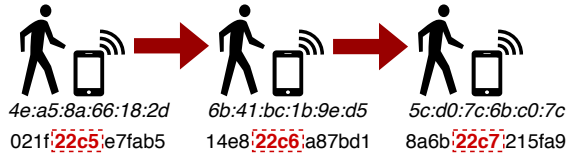
Figure 1: Example of the device address linking via a non-reset counter field. The device is randomizing its address (in italic) over time while incrementing a counter (in bold) in the broadcasted data. Such a 2-byte long counter can be leveraged by a passive attacker to link together frames generated with the three different device addresses.