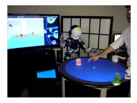
Figure 1: Physical interaction between the iCub and an human. Both are interacting with the ReacTable (the blue table). Behind the robot, its internal representation is displayed on a screen.

In robotic systems based on human-inspired robot task learning [1], significant attention has been allocated to the mechanisms that underlie the ability to acquire knowledge from and encode the individual's accumulated experience [2], and to use this accumulated experience to adapt to novel situations [3]. In this context we consider research on autobiographical memory (ABM) and mechanisms by which ABM can be used to generate new knowledge [4].