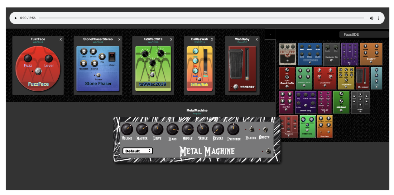
FIg 4. The "Rack" plugin. Inspired by GarageBand's pedal FX and Amp Sim manager.