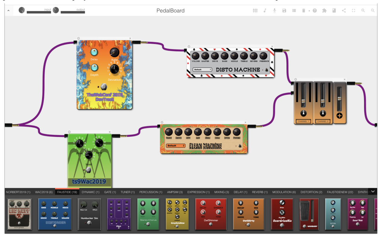
Fig 3. The Virtual Pedalboard host application discovers newly created plugins (using the REST APIs of WAP servers). We can see on top left the plugin from Fig. 2.

Chromium, or Firefox Nightly to run these applications. They are the only browsers with the required API implementations, and polyfills for some of these APIs are not available or lack performance.