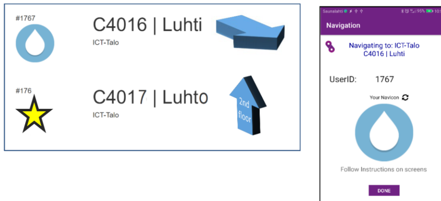
Fig. 1. On the right: The user interface of the mobile application with the avatar (waterdrop) and the destination information. On the left: An example of a screen showing the direction to two different destinations with 3D arrows (2 nd floor and behind on the right).