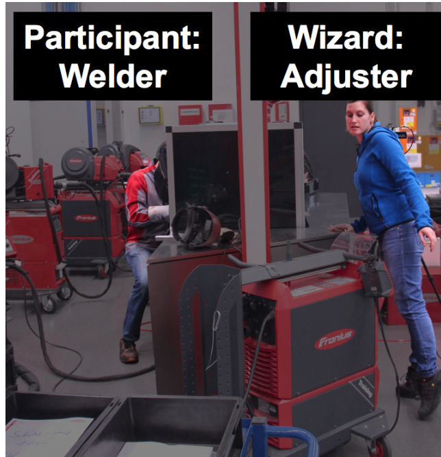
Fig. 2. Setting during WoZ Phase 1.

the tests, audio and video material was synchronized and transcribed. The transcript was then placed into the synchronized audio and video files as subtitles to facilitate analysis of the videos that included a wide range of different noises.