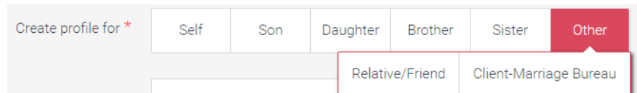
Fig. 1. Profile creation on Shaadi.com

Most users of matrimonial websites in India utilize three websites: Shaadi.com, Bharatmatrimony.com, and Jeevansathi.com [83]. Business has grown dramatically as the sites provide efficient spousal search when conventional methods of locating a spouse are not working [37]. They allow users to create profiles within regional, religious, community-specific, and linguistic sub-sites [83]. For instance, a marriage seeker can create a profile on Shaadi.com’s regional sub-site, Tamilmatrimony.com.