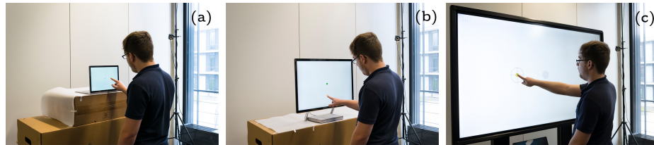
Fig. 2: Setup for conditions (a) SMALL, (b) MEDIUM, and (c) LARGE.

For an analysis in multiple directions and with different IDs, target circles were computed with three possible distances/amplitudes (17%, 23%, 30% of the