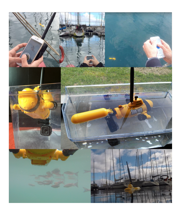
Fig. 2. Seamote USV - Deployed in-situ, used for the preliminary tests with participants. Top: Seamote App, used from the marina standpoint. Middle: Seamote USV buoyancy and stability tests. Bottom: Underwater imagery collected by the participants and Seamote USV against other marine vessels found in local marina.