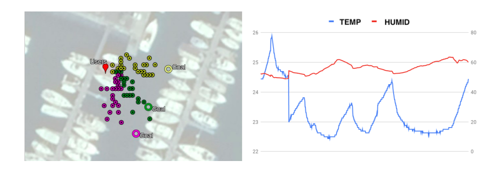
Fig. 4. Seamote In-situ test - 3 GPS Trips denoted in colors from one point of the harbour to the other and back. Fig. 5. Environmental telemetry sensor data obtained from the Seamote USV.

In figure 5 we portray the temperature and humidity, obtained from the Seamote USV during the tests. Data shows temperature changes with peaks when taken out of the water between tests, as well as the influence of heat by the motors. Also, we observe nuances in humidity readings indicating the time spent in water. In figure 6, we plot the RSSI against the SNR. Although the short distance did not allow for the RSSI to be weak, this shows that the noise was kept consistent in the aquatic environment. The SNR showed values ranging from 5 to 7, indicating a good ratio that allows the radio to capture the signal against the environment noise - RSSI (M = -44.8, SD = 7.9) and SNR (M = 6.3, SD = 0.5) with N = 265. Figure 7 depicts the most used commands issued from the application, having forwards at full speed more used. Figure 8 depicts the pitch and roll recorded during the tests, showing a clear tendency of the Seamote USV to lean backwards. This is consistent with control commands from Seamote App, lifting the nose and dipping the back of the USV. Roll parameter proves to be stable in aquatic settings, as observed in the tests, only being tilted by abrupt corners, and always remaining in the correct position, due to the underwater camera stabilizing the center of mass.