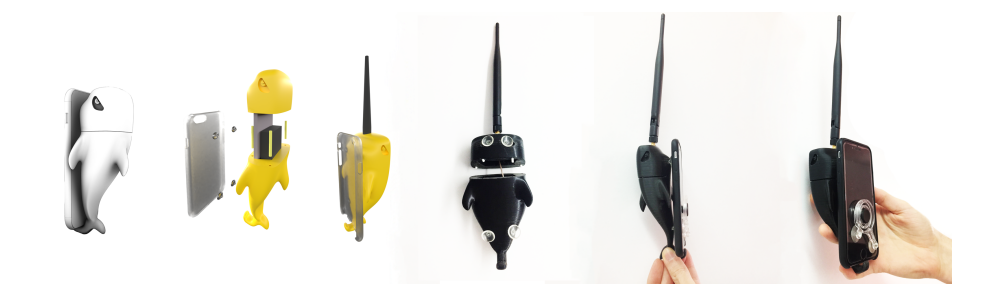
Fig. 1. Seamote Bridge. An evolution of special design case with the embedded microcontroller and LoRa antenna, capable to be mounted to the smartphone using suction cups.

Seamote Bridge Being a custom designed case, it serves to contain basic microcontroller hardware. It is comprised of a single LoPy4 with an antenna and battery, shown in figure 1. Acting as a network integrator, Seamote Bridge runs a HTTP server, which receives commands from the control devices, in the form of POST requests, and forwards them in further via LoRa payloads to the USV end devices. Algorithm is designed to stop sending motor commands with included lag (between 1-2 seconds) should the participant stop using the Seamote App. In this setup, LoRa is not being used with the LoRaWAN network, and is used instead as a point-to-point communication, thus not requiring a gateway with an internet connection. The access to the HTTP server is done via an Access Point (AP) running on the Seamote Bridge, which also features a captive portal, popping-up on a Seamote App as a dialog upon connecting to the AP. Also, we designed an encasing of the Seamote Bridge which resembles a marine creature, in this case a tiger shark. It serves to contain the electronics inside, being coupled with the smartphone via suction cups, and being supported by the tail and fins, as depicted in figure 1.