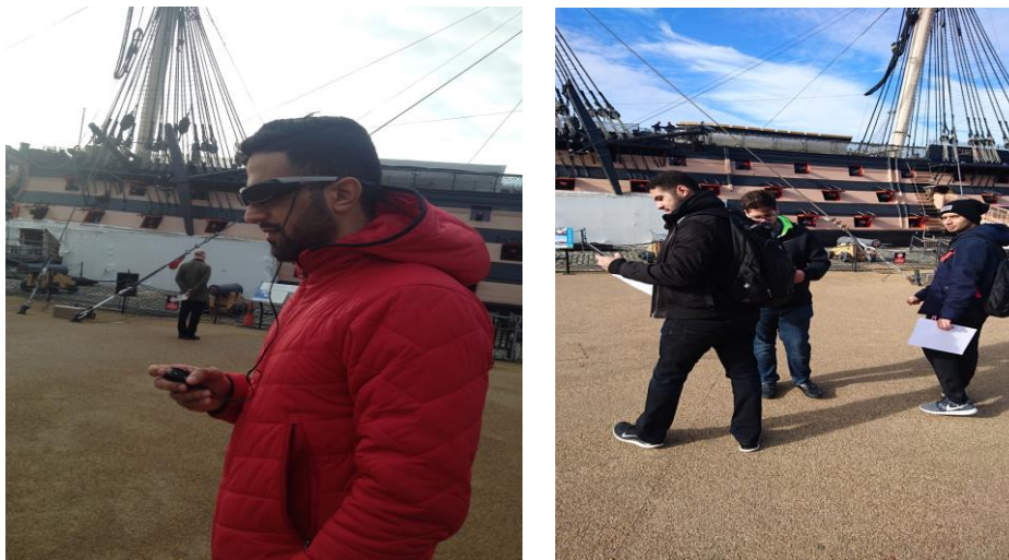
Fig.5. Participants while using SmartC via smart eye glasses and mobile phones in the field