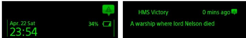
Fig. 3. Smart eye glasses interfaces