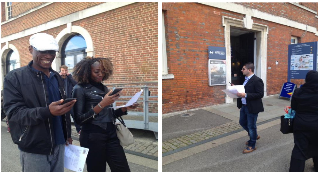
Fig.4. Participants while using the SmartC app in the field

To obtain more in-depth opinions regarding the experience in using the app, a brief group interview was held with participants after filling the questionnaire. Participants were asked about their experience using the app and to point out any challenges that they experienced, if any. In addition, they were asked if they have any suggestions for improving the app. Notes were taken by the researcher to document participants’ answers.