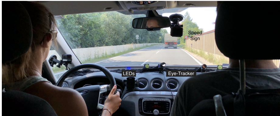
Fig. 1. Setup in the car. The gaze of the front-seat passenger is captured with an eye-tracking system and is visualized for the driver with blue glowing LEDs on an LED-strip mounted at the bottom of the windshield. The front-seat passenger is currently looking at the speed sign ahead on the right side of the street.

to capture the front-seat passenger’s gaze, which is visualized in real-time for the driver. The visualization could be done in various ways by using, e.g., full windshield visualizations (via an head-up display) or ambient light information (e.g., LEDs). Previous research indicates that using ambient light information is more beneficial in terms of less visual distraction for the driver (e.g., [15, 31]). In our case, we used an LED-strip mounted at the bottom of the windshield in order to provide horizontal spatial information. For example, a front-seat passenger wants to point to a speed limit sign ahead. While looking at the sign, an LED segment is lit at the bottom of the windshield at the corresponding position in line of sight between the driver and the traffic sign, i.e., the gaze visualization is mapped to the driver’s perspective (see Figure 1).