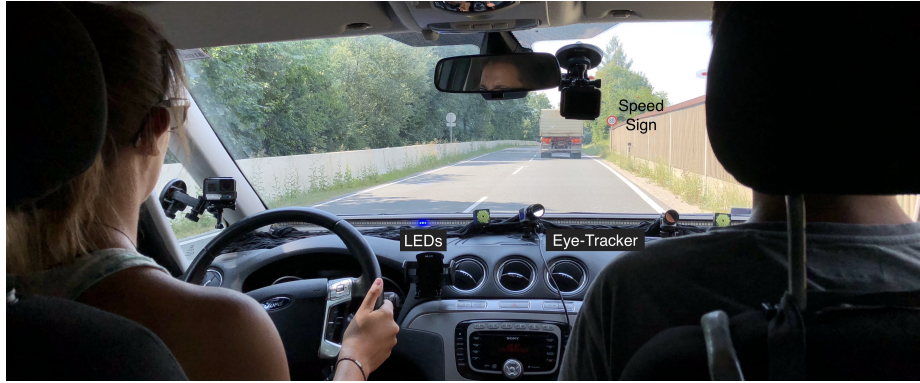
Fig. 1. Setup in the car. The gaze of the front-seat passenger is captured with an eye-tracking system and is visualized for the driver with blue glowing LEDs on an LED-strip mounted at the bottom of the windshield. The front-seat passenger is currently looking at the speed sign ahead on the right side of the street.

to capture the front-seat passenger’s gaze, which is visualized in real-time for the driver. The visualization could be done in various ways by using, e.g., full windshield visualizations (via an head-up display) or ambient light information (e.g., LEDs). Previous research indicates that using ambient light information is more beneficial in terms of less visual distraction for the driver (e.g., [15, 31]). In our case, we used an LED-strip mounted at the bottom of the windshield in order to provide horizontal spatial information. For example, a front-seat passenger wants to point to a speed limit sign ahead. While looking at the sign, an LED segment is lit at the bottom of the windshield at the corresponding position in line of sight between the driver and the traffic sign, i.e., the gaze visualization is mapped to the driver’s perspective (see Figure 1).