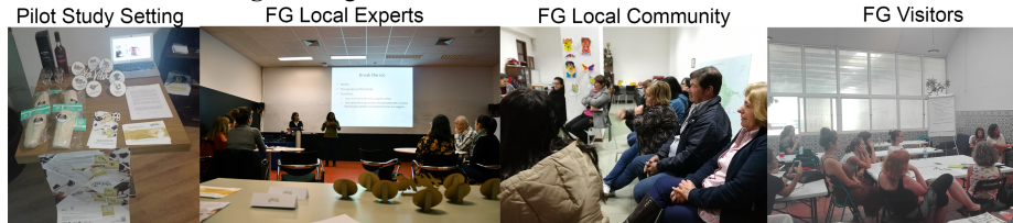
Fig. 4. Images from the conducted evaluation sessions

Sessions were recorded both in audio and on video; observations and non-verbal interactions were noted.