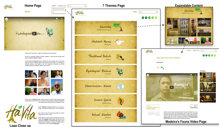
Fig. 1. Há-Vita graphical elements highlighting the connection to Madeira’s nature and traditions (e.g., the main logo represents of one of the indigenous trees; Icon 3 from main categories depicts Poncha on of the traditional beverages of Madeira)

Conceptualization of the interface: The Há-Vita homepage presents a promotional video introducing the platform’s main goal. The top of the page contains a drop-down menu, where clicking on the word Episodes leads to the identification of the seven themes, drawn from the interviews and extensive interactions with the locals. The icons in the drop-down menu expand, and by clicking inside the expansion, the visitors are forwarded to the page where the locals express their knowledge regarding the chosen topic (Fig 1.). The interface was deployed in a customized WordPress template.