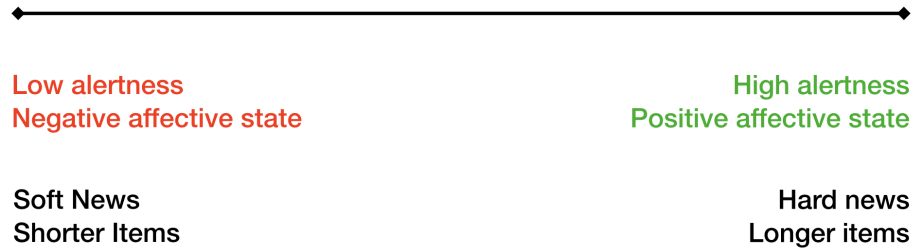
Fig. 2. User state - News consumption spectrum.

does split my attention, but I'm focused on the news, not on the music. " P6 - Interview