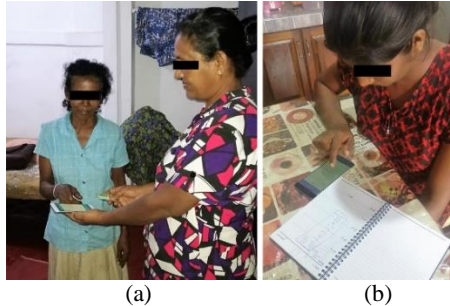
Fig. 2. (a) A group leader visiting a house of a member with the application to collect payment (b) A member adding her transactions to the application by referring to her notebook

It was clear that some these members thought that the application would take away their chances to negotiate with their leaders on payments. The other group opted out stating their concern over the data usage of the application.