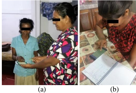
Fig. 2. (a) A group leader visiting a house of a member with the application to collect payment (b) A member adding her transactions to the application by referring to her notebook

It was clear that some these members thought that the application would take away their chances to negotiate with their leaders on payments. The other group opted out stating their concern over the data usage of the application.