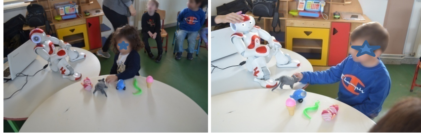
Fig. 1. Implementations of Farm Animals (top), Ling Sounds Story (bottom)

In terms of data collection, the school therapist recorded each child's performance in every activity completed (Ling sounds story, Music density, Farm Animals, Vegetables) in every session. Although NAO gave a "try again" option for the sake of play and learn, for data collection purposes the therapist marked a correct answer only on child's first trial and only for correctly detected sounds. Table 2 presents an example of data recording for the "Ling Sounds Story." Similar tables were used for data recording of other activities in every session and for each participating child. At the end of the activity the therapist together with the special teacher who observed the study participated in a group-interview with the researchers (authors of this work). The interview aimed to elicit details about the overall experience and perceived added value of the technology.