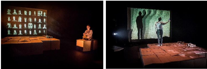
Fig. 2. Digital projection of young company recordings in “A Song for Ella Grey”

“I wasn't digitally on-stage a lot since I only did a week but it did feel weird seeing myself there because it's something new and different. I was quite excited to think that I was technically on-stage and part of such a spectacular performance and people would see me. I think it's a brilliant way to extend the metaphorical 'self-life' of theatre.”