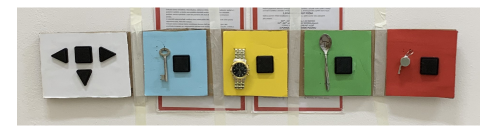
Fig. 3: Design C – lo-fi prototype introducing a tactile cursor providing information about the surrounding and current location. The panel with key symbol served to navigate the user back to the room. Other three panel's function did not change.