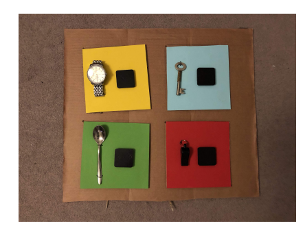
Fig. 1: Design A - lo-fi prototype introducing four panels with real-world symbols and buttons representing four functions of an orientation terminal.