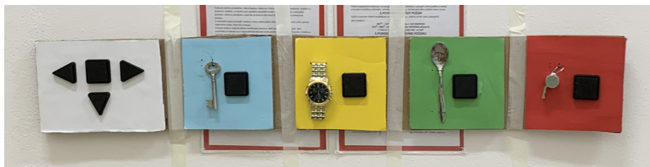
Fig. 3: Design C – lo-fi prototype introducing a tactile cursor providing information about the surrounding and current location. The panel with key symbol served to navigate the user back to the room. Other three panel's function did not change.