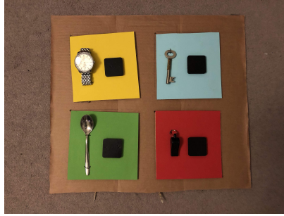
Fig. 1: Design A – lo-fi prototype introducing four panels with real-world symbols and buttons representing four functions of an orientation terminal.