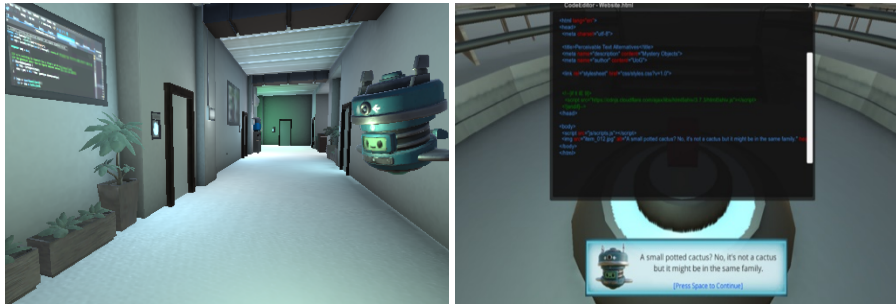
Fig. 1. A hallway where doors would lead to rooms with various scenarios (Left). A Mystery Box scenario in progress in one of the rooms (Right)

game, as the former allows for the implementation of Knowledge sharing mechanics for the ‘Philanthropist’ user type, while the latter helps to enable social competition and discovery in line with the ‘Achiever’, ‘Socializer’ and ‘Player’ user types. Both provide for a sense of belonging and ownership [26], and support a competitive experience.