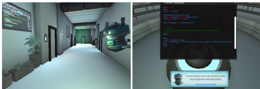
Fig. 1. A hallway where doors would lead to rooms with various scenarios (Left). A Mystery Box scenario in progress in one of the rooms (Right)

game, as the former allows for the implementation of Knowledge sharing mechanics for the ‘Philanthropist’ user type, while the latter helps to enable social competition and discovery in line with the ‘Achiever’, ‘Socializer’ and ‘Player’ user types. Both provide for a sense of belonging and ownership [26], and support a competitive experience.