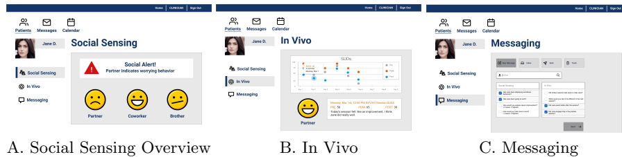
Fig. 1: Clinician Facing Feedback from Trusted Others

The social sensing prototype has three main sections: (1) a social sensing overview section that would enable a clinician to view a trusted others assessment of a patients progress (Fig. 1A), (2) an in vivo section that displays a trusted others assessment of a patients in vivo session (Fig. 1B), and (3) a messaging section that would enable a clinician to message a trusted other with pre-formulated questions pertaining to a patients state and progress (Fig. 1C).