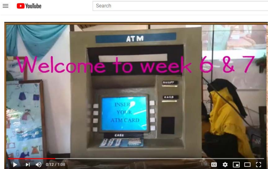
Week 6 &amp; 7