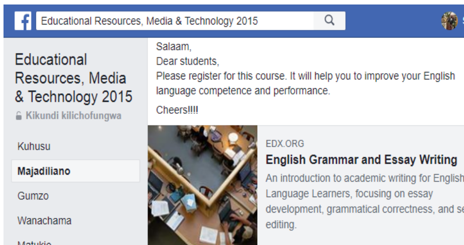
Fig. 2. Example of Facebook page used Teaching -Learning

The use of Facebook in teaching-learning process has been appreciated by students since it gives them the opportunity to follow the instruction anytime. They also consider it as positive way of using social media. They have added that Facebook also enhances communication and collaboration between them and the instructor as well as among themselves. This is reinforced by the study of [11] which shows the immense potential of Social media in teaching and learning at SUZA.