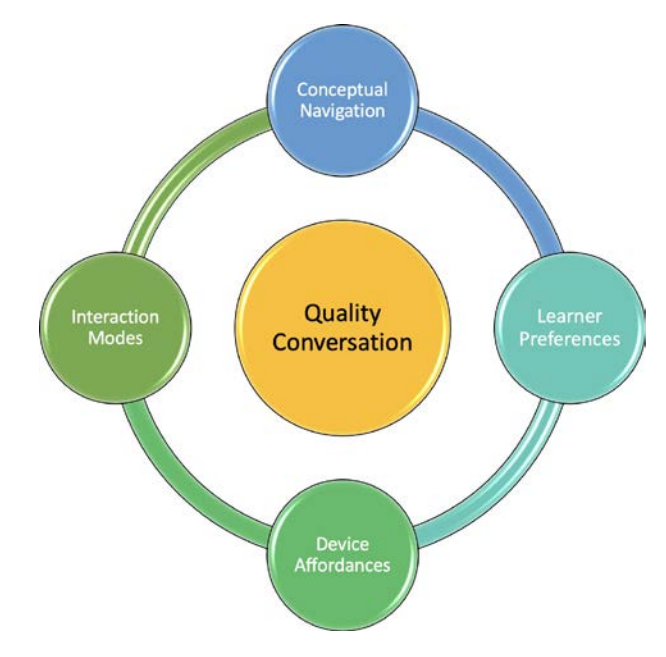
Fig. 1. 5 design principles

Apart from the first principle, a quality conversation, the other four represent adaptation to different aspects. The learner preferences principle adapts to the learner, the device affordances principle adapts to the device, the conceptual navigation principle adapts to the topic under study, and the interaction mode principle adapts to the mood and need at each moment.