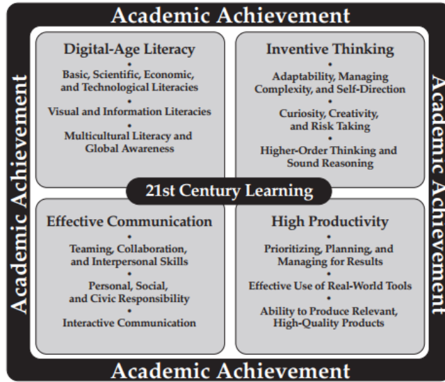
Fig. 3. The EnGauge 21 st Century Skills [9]

In 2005, the Organization for Economic Cooperation and Development (OECD) ministries emphasised: “Sustainable development and social cohesion depend critically on the competencies of all of our population – with competencies understood to cover knowledge, skills, attitudes and values.” In the Programme for International Student Assessment (PISA), the OECD provided its conception of 21st century skills [10] combining three main categories of skills: Using tools interactively, Interacting in heterogeneous groups and Act autonomously. The highlights of this framework are managing and resolving conflicts skill in the second category. Leadership can be found in “The ability to form and conduct life plans and personal projects” in the third category. The OECD framework is more general than P21.