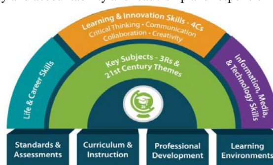
Fig. 2. The Partnership 21 st Century Learning framework (P21) schema [8]

The Partnership 21 st Century Learning framework (P21) developed by Battelle for Kids [8] which are educators, education experts and business leaders who defined skill and knowledge that students require to succeed in their life. The framework is being used by many educators in several countries across the world. Key subjects, i.e. that are essential to student success include English, reading, or language arts, world languages; arts; mathematics, economics; science; geography; history; government; and civics. As presented in figure 2, the framework divides skills into three categories: (1) Learning and Innovation skills include creativity and innovation, critical thinking and problem solving, communication and collaboration. The next category is (2) Information, Media and Technology skills including information, media and ICT literacies. The last category is (3) Life and Career skills including flexibility and adaptability, initiative and self-direction, social and cross-cultural skills, productivity and accountability and leadership and responsibility.