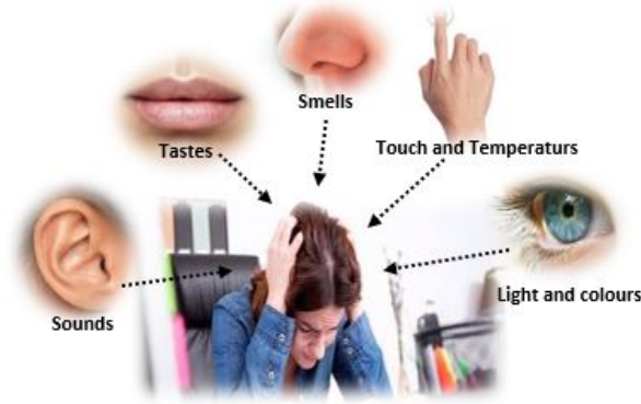
Fig. 1. The underlying idea of this work is to provide an overview of the state of the art in the area of assistive technology for people with Autism or autism spectrum disorder (ASD) in the workplace and in everyday life by considering different sensor channels, such as sounds, touch, tastes, smells, light, colours or temperatures.

or several areas throughout the individuals' lives. One of these areas is work or work environments where adults with ASD are facing daunting challenges. There is a good indication, that the challenges which individuals with autism face at work because of changing environmental situations are one of the causes of their remarkable unemployment rate of 80+% [19]. Employment is an essential aspect of life for individuals including those with ASD [24]. "Work facilitates economic independence, engendering a sense of purpose and accomplishment, providing opportunities for socialisation and a mechanism through which to contribute to society" [41]. Hence, an unemployment rate of 80+% of a group of people that currently constitutes 1% of the world population is very alarming. Nevertheless, in recent years, people with ASD have received improved attention from the labour market including some well-known employers such as Freddie Mac, Microsoft, SAP, Willis Towers Watson, Walgreens [23]. In parallel, there is a growing international interest in the use of assistive technology to support people with ASD and other impairments with life skills/independence [28].