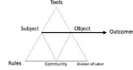
Fig. 1. Activity System

In this study, we adopted the activity theory [45] and, in particular, the activity system [46], as it gives a holistic understanding of a “real-world situation.” The activity system has six elements (Tools, Subjects, Object, Rules, Community, and Division of Labor) as shown in Fig. 1. A critical and central part of the activity theory is contradictions. Contradictions may arise when an external force modifies an element of the activity system, which causes potential imbalances among the elements. Some studies have used the activity theory (particularly the complete activity system) in the education context [5, 47, 48].