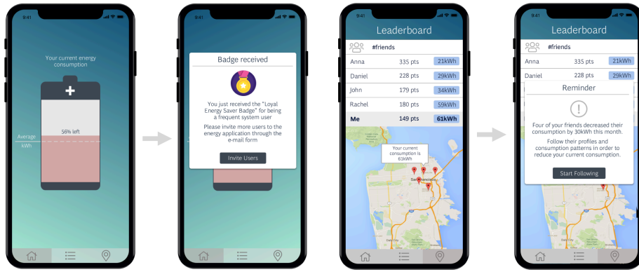
Fig. 1. Sample Story-Board (Reciprocity – left; Liking – right)

Follow their profiles and consumption patterns in order to reduce your current consumption.