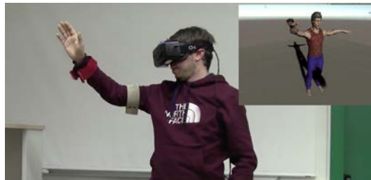
Fig. 1. The orientation of the user’s arm is tracked wearing two armbands, one at the forearm and one at the upper arm.