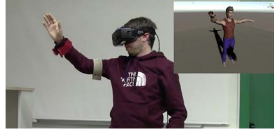
Fig. 1. The orientation of the user's arm is tracked wearing two armbands, one at the forearm and one at the upper arm.