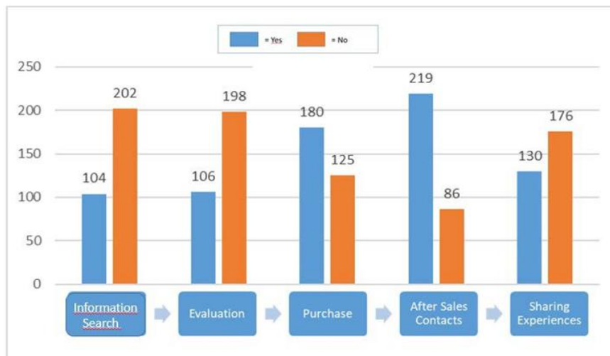
Table 1. Respondents’ willingness to share their data at different phases of the customer journey.

Findings indicated that respondents were more willing to share their data when they were “in buying mode” and actually in the process of buying a product or service. On the other hand, respondents had data privacy concerns at the beginning of their customer journeys. These results challenged current marketing practices, such as re-targeting, which is typically done in a digital environment. We further analyzed the sample according to gender, and there were some indications that female respondents were more willing to interact with the company during the after-purchase phase, but differences were not statistically significant.