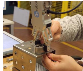
Fig. 1. Synthetic description of a sub-process of collaborative Human-Robot assembly: (a) assembly diagram, (b) drawing of the components to be assembled, and (c) example of assembly task performed collaboratively.