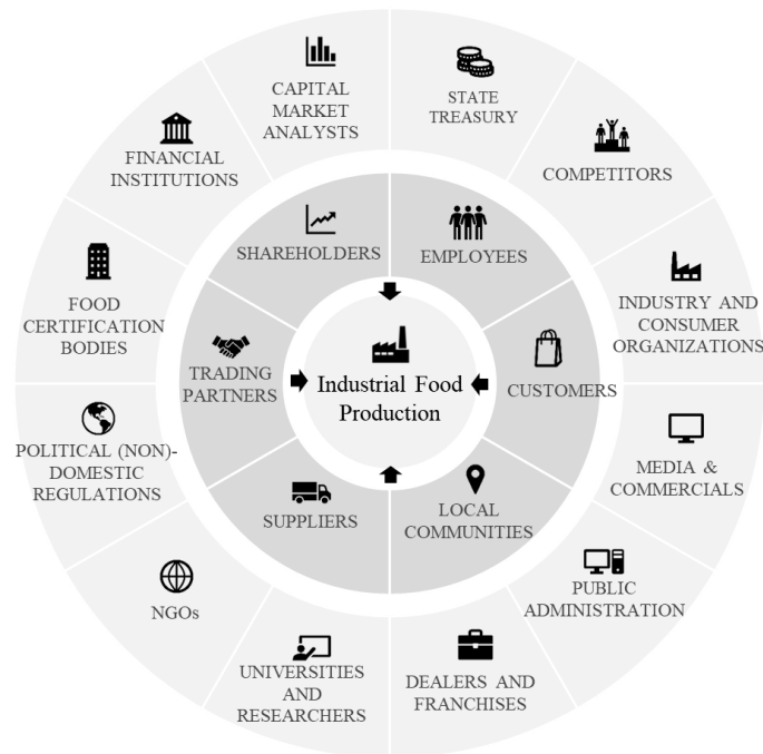
Figure 1: Mapping of stakeholders in the industrial food production ecosystem, based on [5]

to meet the increasing requirements of consumers and political regulations, demanding high quality and safety, sustainability, tracking and tracing of products, versatility and availability everywhere and at any time. Figure 1 shows the key stakeholders of industrial food production: